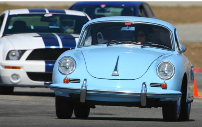
Vintage Porsche of Jim Beardsley