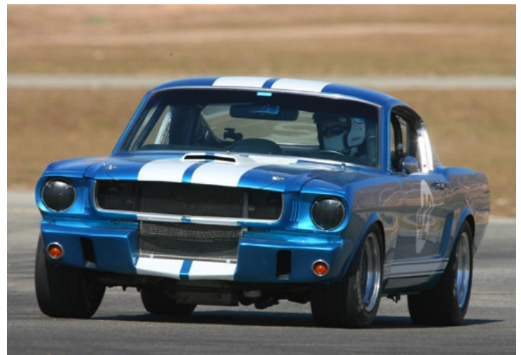
Vintage race prepped 65 Mustang of Greg Taylor