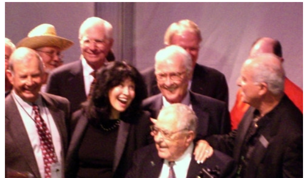
Carroll Shelby and friends