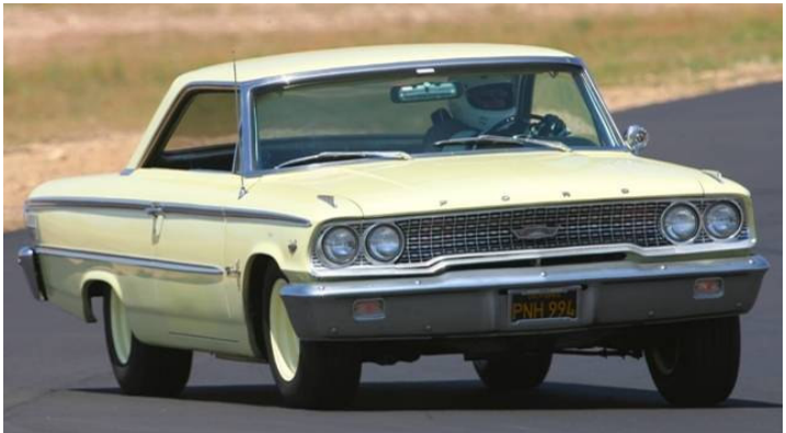
Bill Kelley's 4-speed 63 1/2 Galaxie has tri-power 406 motor-vation